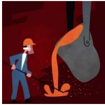
Smelting &amp; Mining